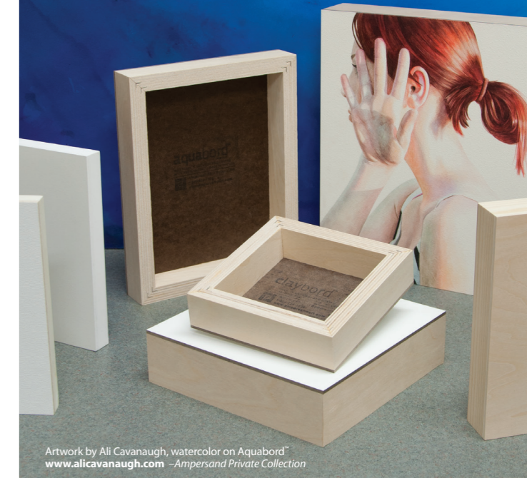
Artwork by Ali Cavanaugh, watercolor on Aquabord™ www.alicavanaugh.com - Ampersand Private Collection

Ampersand Extraordinary surfaces for your art.