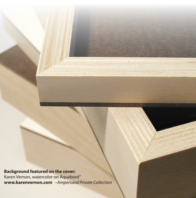
Background featured on the cover: Karen Vernon, watercolor on Aquabord™ www.karenvernon.com - Ampersand Private Collection

Simply put, paintings on rigid and well-prepared surfaces outlast those on stretched canvas and paper. The proof - icon paintings from the 3rd and 4th centuries painted on prepared wood panels remain in excellent condition, while many paintings on stretched canvas from the last century have already experienced major cracking and deterioration.